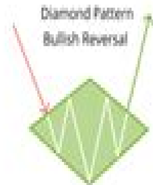
Diamond Pattern Bearish Reversal