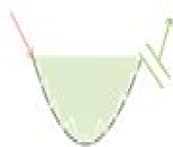
Cup & Handle Bullish Reversal