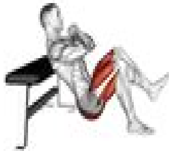
HIP THRUST JUMP