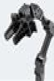
OpenManipulator robotic arm