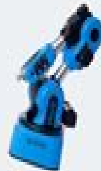
Niryo 6-axis robot arm