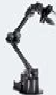
Interbotix Robotic Arm