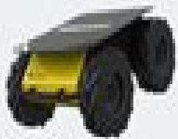
Autonomous mobile robots