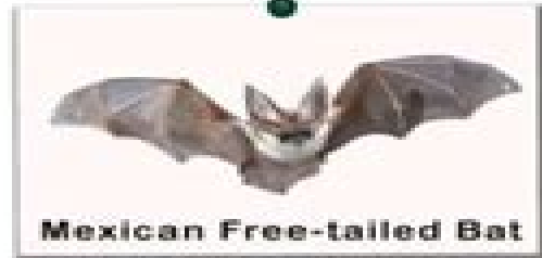
Mexican Free-tailed Bat