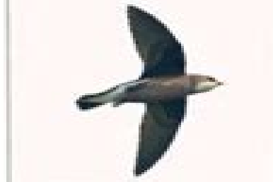
White-Throated Needletail Swift