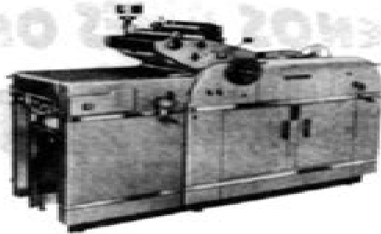
MULTILITH OFFSET MODELO 1250 Equipped with controls of modern and simplified design Modelo 1250 214.

A fin de que usted obtenga el mayor rendimiento y producción de su Multilith Offset, la Corporación Addressograph-Multigraph mantiene 144 Succursales en los Estados Unidos. Esta oficina representada internacionalmente por Subsidiarias y Distribuidoras en la mayoría de las principales ciudades del mundo. Todas ellas ofrecen el servicio A-M y cuentan con personal competente en ventas y servicio, así como suministros de materiales, repuestos y asistencia sobre métodos y procedimientos.