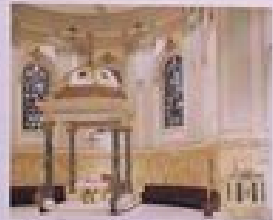
Figure 3: A lighting design that is integrated with the architecture. The lighting design team has worked closely with the architect to ensure that the lighting design is integrated with the architecture.