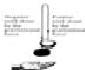
FIG. 8.1 A ball is thrown up, then falls. As it rises, the gravitational force does negative work on it, decreasing its kinetic energy. As the ball falls, the gravitational force does positive work on it, increasing its kinetic energy.

e.g. elastic potential energy – associated with the state of compression or extension of an elastic object.