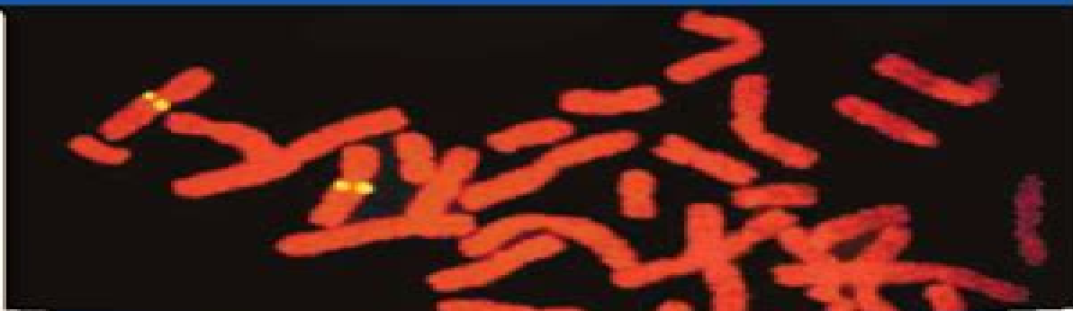
Figure 15.1 The four yellow dots mark the locations of a specific gene, tagged with a fluorescent yellow dye, on a pair of homologous chromosomes. The chromosomes have duplicated, so each chromosome has two sister chromatids, each with a copy of the gene. This provides a visual demonstration that genes—Mendel's "factors"—are segments of DNA located along chromosomes.