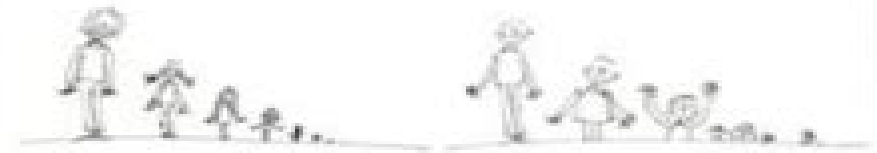
Walking away from the viewer