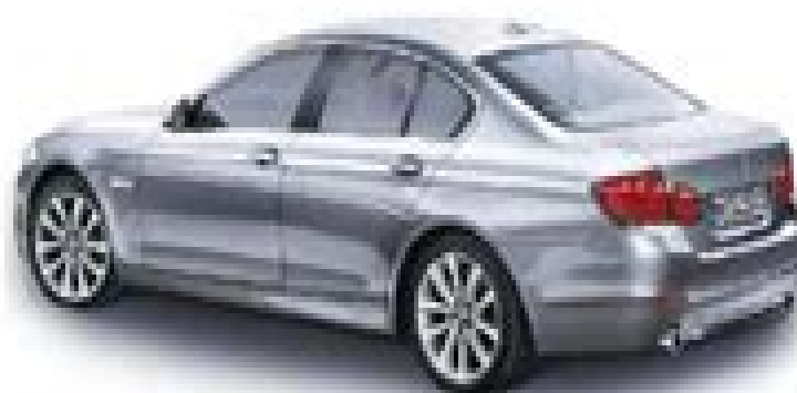
Fig. 1. Identifying BMW 5 Series Saloon Courtesy of BMW OF NORTH AMERICA, INC.

The F10 5 Series was introduced in to the US market in March of 2009. The vehicle is available in 528i, 535i and 550i models.