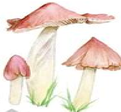
10. Pink Waxcap Porpolamopsis calyptriformis