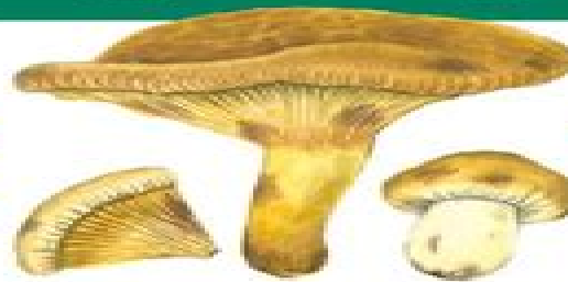
2. Brown Rollrim Paxillus involutus