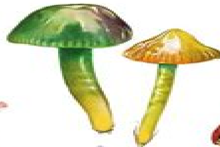
8. Parrot Waxcap Gliophorus psittacinus