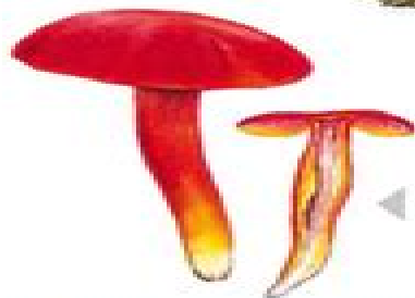
9. Scarlet Waxcap Hygrocybe coccinea