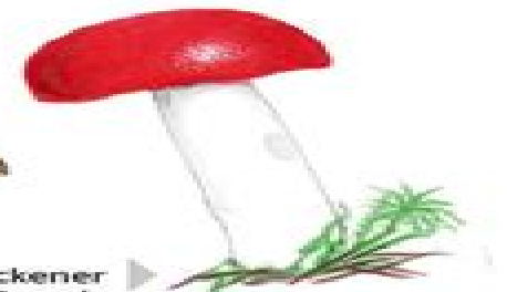
6. Sickener Russula emetica