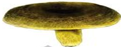
4. Ugly Milkcap Lactarius turpis