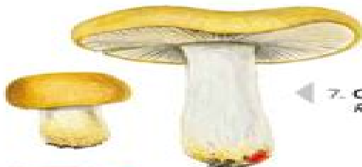
7. Ochre Brittlegill Russula ochroleuca