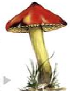
11. Blackening Waxcap Hygrocybe conica

☠ Poisonous / toxic Illustrations not to scale