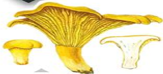
1. Chanterelle Cantharellus cibarius