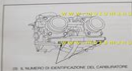
(3) IL NUMERO DI IDENTIFICAZIONE DEL CARBURELLATORE È STAMPATO SULLA BASSA PARTE DI OGNI CARBURELLATORE.