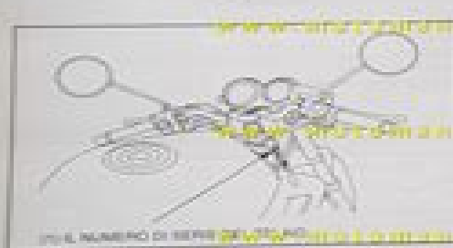
(1) IL NUMERO DI SERIE DEL MOTORE È STAMPATO SUL LATO DESTRO DEL CARBURELLATORE.