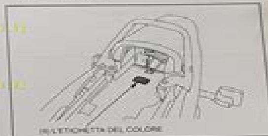
(4) L'ETICHETTA DEL COLORE È APPLICATA SUL PARAFANGO POSTERIORE. NELLA SCELTA, SE DESIDERI ORDINARE PEZZI CODIFICATI A SECONDA DEL COLORE, SPECIFICARE SEMPRE IL CODICE DESIGNATO DAL COLORE.