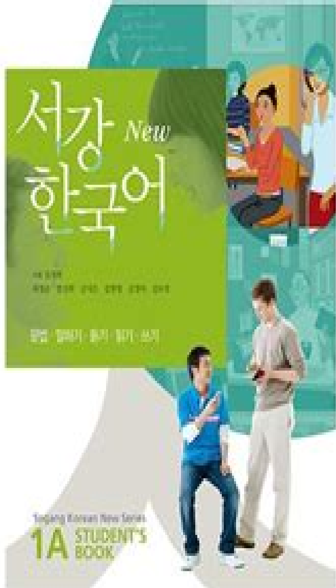
Sogang Korean 1A Student's Book