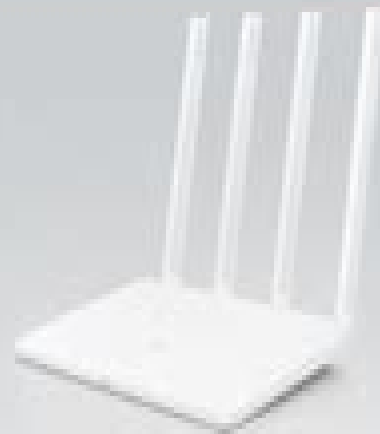
Mi Router 3C