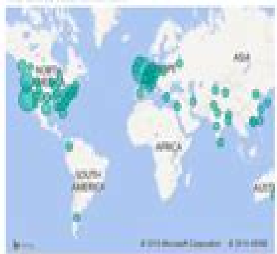
Total sales by GeographicRegion