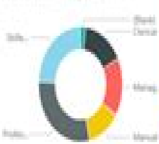
Count of customers by Occupation