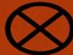
LOT OF FORTUNE