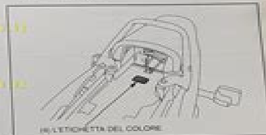
(4) L'ETICHETTA DEL COLORE è applicata sul parafango posteriore. Nella lista, di desidera ordinare pezzi codificati a seconda del colore, specificare sempre il codice designato del colore.