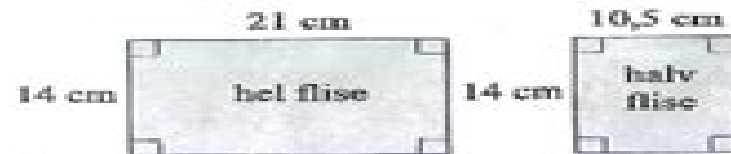
Figur 1 (skitse)

Lucas og hans far vil bruge fliser, der har mål som vist på figur 1. Fliserne skal ligge i det mønster, der er påbegyndt på figur 2.