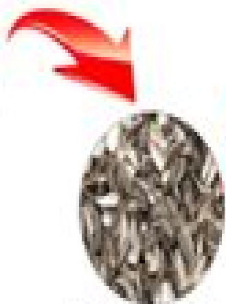
Sunflower seed husk