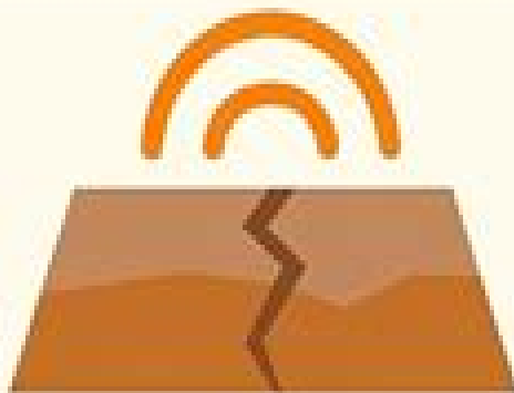
EARTHQUAKE SEISMIC WAVES