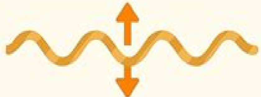
WAVES ON A STRING