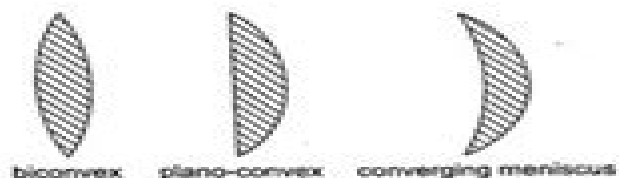
Fig. 1.1(a) Converging lenses

A lens which is thicker at its centre than at its edges converges light and is called convex or converging lens . A lens which is thicker at its edges than at its centre diverges light and is known as concave or diverging lens .