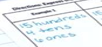
3rd Grade Math Journal Example Free Place Value Lesson

Directions: Express the number 1,500 using only hundreds, tens, and ones.