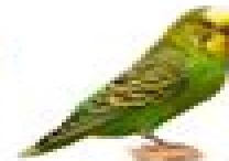
Reptiles and Birds