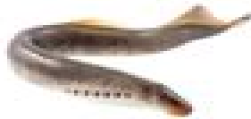
Lamprey and hagfish