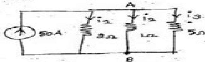
Fig. 11 (a) (ii)