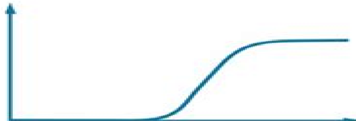
Figure 2. An illustration of a how a high pass filter works.

High pass filters function in the opposite manner of a low pass filter. High pass filters let frequencies above a given frequency pass through the filter while rejecting frequencies below the given frequency.