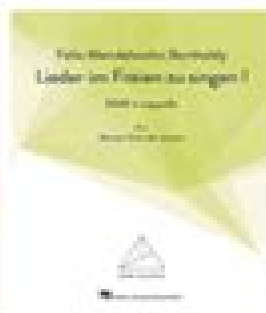
Felix Mendelssohn Lieder im Freien zu singen Vol. 1 HL00373821