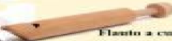
Flauto a cursore