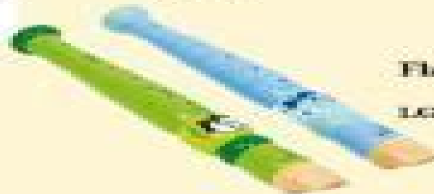
Flauto in legno