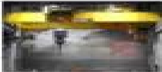
This class "T0" generating station crane is rarely used.

As to the types of cranes covered under CMMA Specification No. T0 (Top Running Bridge and Gantry Type Multiple Drive Electric Overhead Traveling Cranes), there are six (6) different classifications of cranes, each dependent on duty cycle. Within the CMMA Specification is a numerical method for determining exact crane class based on the expected load spectrum. Aside from this method, the different crane classifications, as generally described by CMMA, are as follows: