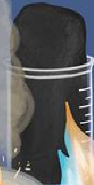
DEHYDRATION OF SUGAR