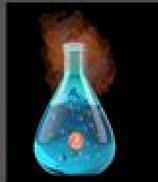
copper and nitric acid