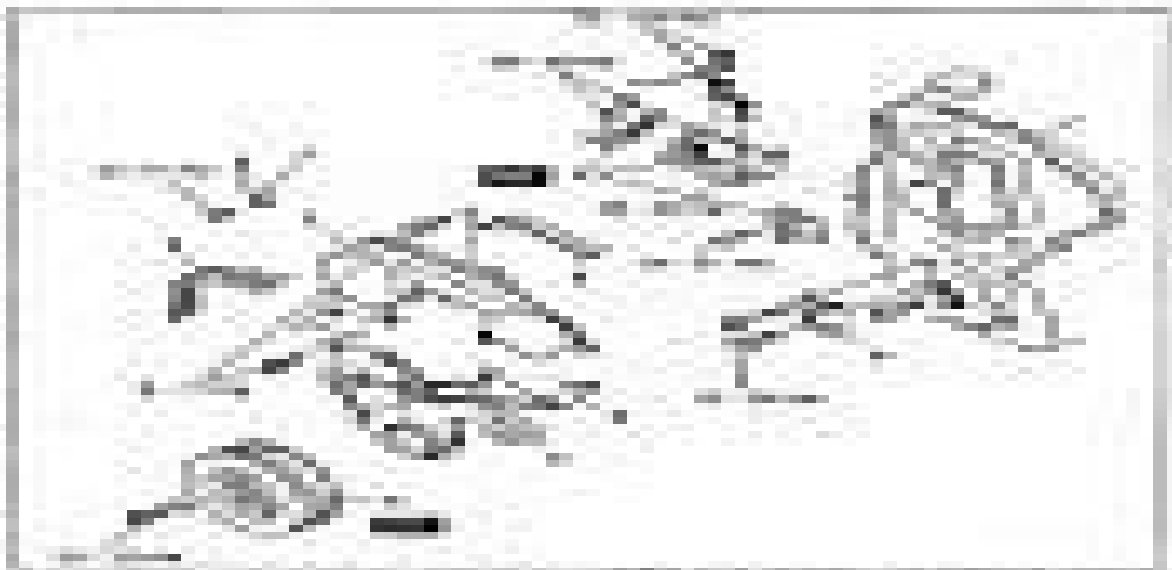
Figure 1: A complex network diagram illustrating the relationships between various components.