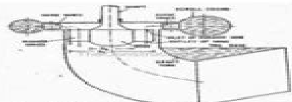
Fig. 1.2 Schematic diagram of Kaplan Turbine