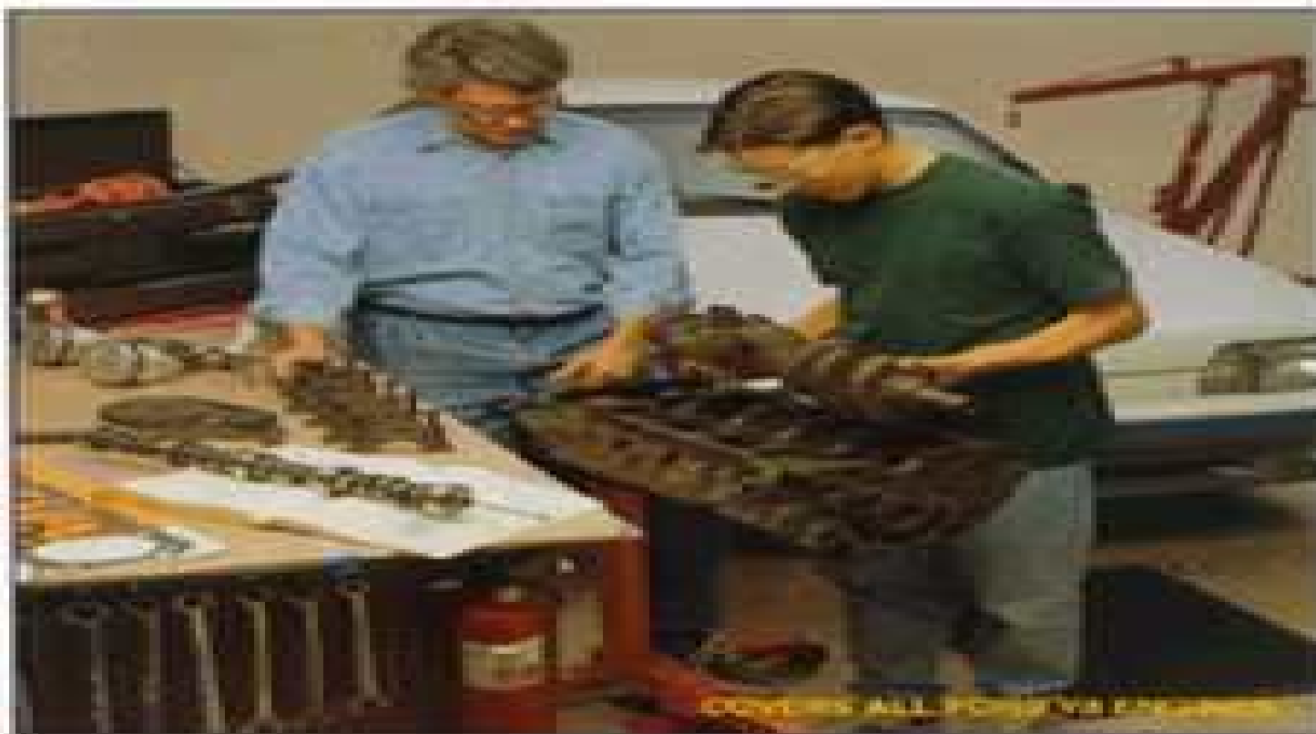
COVERS ALL FORD V6 ENGINES