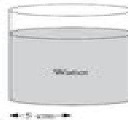
Diagram NOT accurately drawn

Give your answer correct to 1 decimal place.