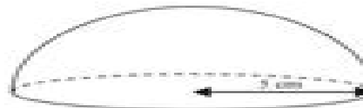
Diagram NOT accurately drawn