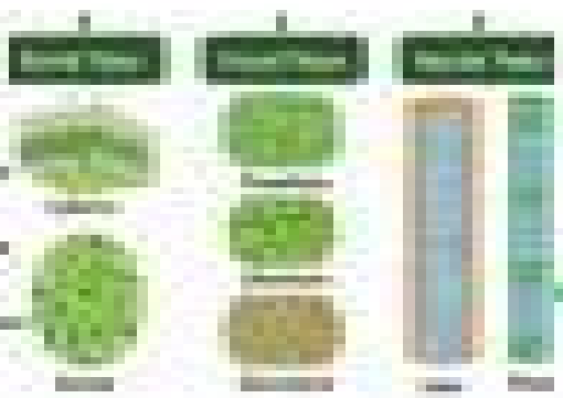
Diagram illustrating the structure and major functional features of the root, ground, and aerial stems, primary and secondary growth.