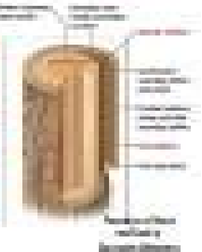
Diagram illustrating the structure and major functional features of the root, ground, and aerial stems, primary and secondary growth.