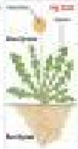
Diagram illustrating the generalised morphology of a plant, showing the stem, leaves, and roots.