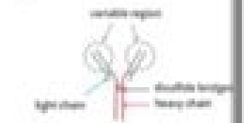
Diagram of antibody structure