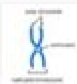
Diagram of mitosis