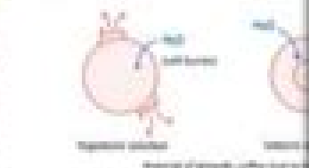
Diagram showing red blood cells in different solutions

Key takeaway point: Water will always move to a cell