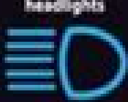
Main beam headlights