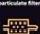
Diesel particulate filter