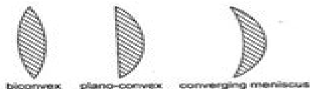
Fig. 1.1(a) Converging lenses

A lens which is thicker at its centre than at its edges converges light and is called convex or converging lens . A lens which is thicker at its edges than at its centre diverges light and is known as concave or diverging lens .