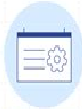
Real-time data integration