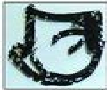
Intalox Metal Tower Packing (IMPT)