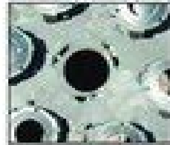
Tray and bubble caps