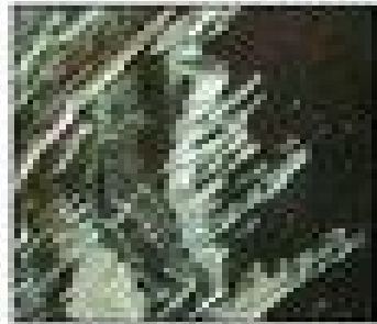
Column wall flash zone