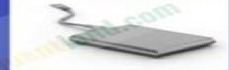
External Hard disk