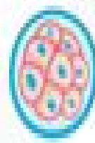
8- CELL STAGE