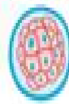
16- CELL STAGE