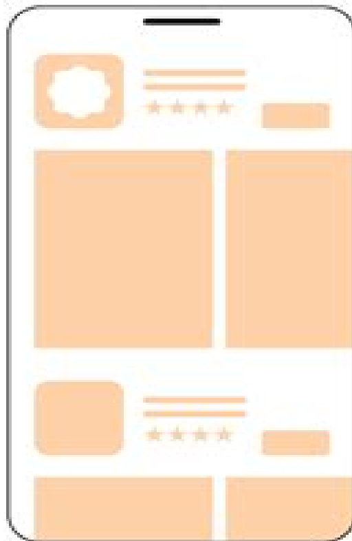
Apple App Store