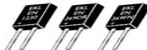
EN-1230 EN-369DR EN-369FN Companion Parts Maximizes Performance Simplifies Installations