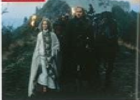
Illustrations by film-makers create the medieval world in their films.

The introduction on the previous page explains the terms 'medieval' and 'medieval Europe'. The timeline on the previous page and the following map will make this information clearer.