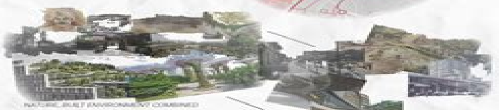
NATURE, BLUE & ENVIRONMENT COMBINED