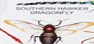
SOUTHERN HAWKER DRAGONFLY