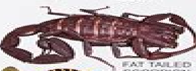
FAT TAILED SCORPION