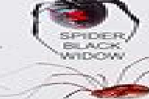
SPIDER BLACK WIDOW