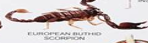
EUROPEAN BUTHID SCORPION