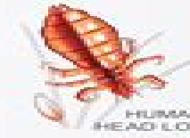
HUMAN HEAD LOUSE