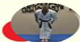
Bow when entering or exiting the dojo.