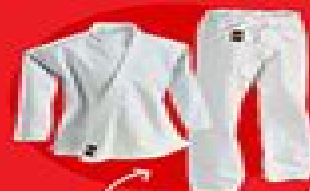
Wear a clean, white karate gi to class.