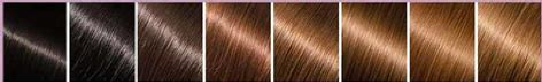
#01 Jet Black #018 Natural Black #02 Dark Brown #04 Chocolate Brown #06 Medium Brown #08 Light Brown #10 Medium Ash Brown #12 Light Golden Brown