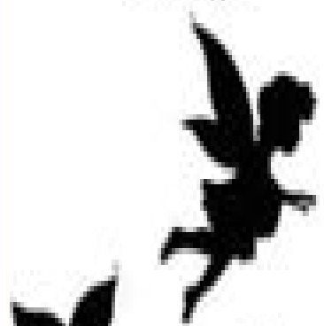
Fantasy World Doodle Puppets