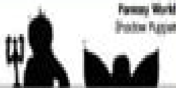
Fantasy World Doodle Puppets