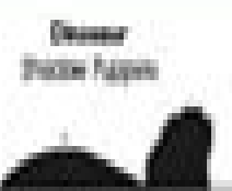
Dragon Doodle Puppets