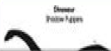
Dragon Doodle Puppets