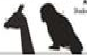
Animal Doodle Puppets